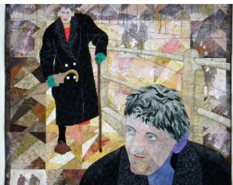
Best of Show