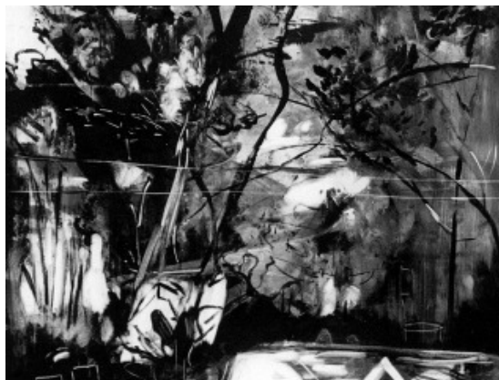
Award of Excellence